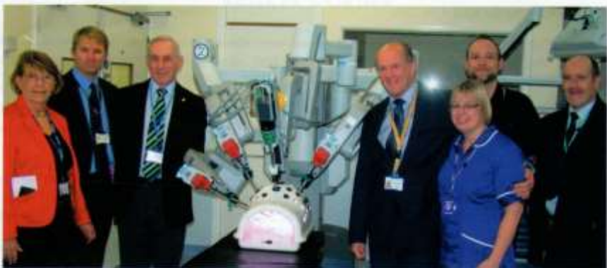
Clockwise from top: Guests enjoying the "Celebrate the Future Ball" The Da Vinci Surgical Robot in use Theatres Open Evening to Introduce the Da Vinci Surgical Robot & guests enjoying the event