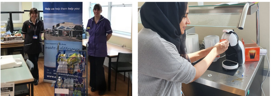
DONATIONS FOR STAFF FROM THE FoEH Clockwise from top left: Coffee machines for Head of Nursing Offices * Twice weekly fruit delivery for the staff * Fridge, snacks & drinks for Doctors Mess * Coffee machine for Doctors Mess * Drinks, snacks fruit and toiletries for the staff hub