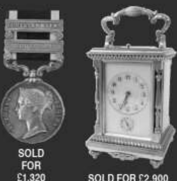
SOLD FOR £2,900

Auction House Finmere Road Eastbourne East Sussex BN22 8QL