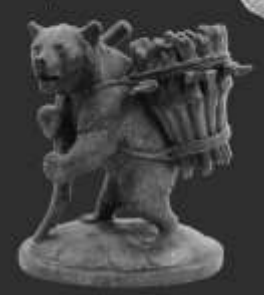
SOLD FOR £840