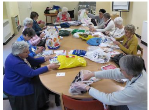
Above: Volunteers sorting cards in 2018